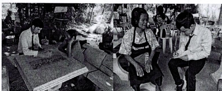
Figure 1-2. Keep records of the research objectives and collect relevant information

recorder was also used during the interviews as a backup. If the interviewee did not wish to record the audio, the recording was stopped. (2) A record form for participatory and non-participatory observations. During participatory observations, the observer engaged in activities with the study group; observations were made while interviewing the groups. On the other hand, in non-participatory observations, the researcher observed groups outside the interview and did not participate in any activities. They used a mobile phone camera to take photographs for research purposes. Certain procedures were followed for collecting information. Initially, the study area, where the community would be interviewed, was surveyed to gather preliminary information. Then, a friendly relationship was built with the local community before interviewing. Information on the cultivation and use of marigolds were obtained by taking appointments from individuals of the date, time, and location. The researcher then collected information on each issue by meeting and discussing it with the target group. If it appeared that the data lacked details, additional information was collected. We analyzed the data obtained from interviews and observations of both participatory and non-participating activities. We then summarized the important points. (Figure 1-2):